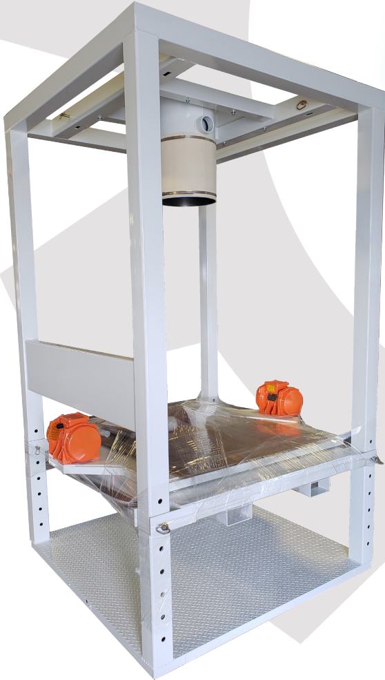
Bulk Bag Loader w/Vibratory Agitation